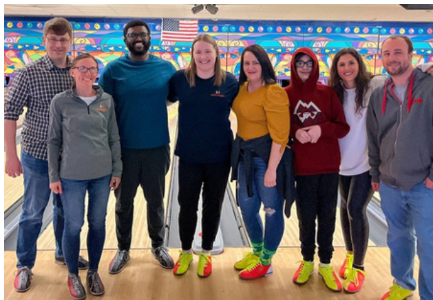
Recovery Center Staff and Supporters